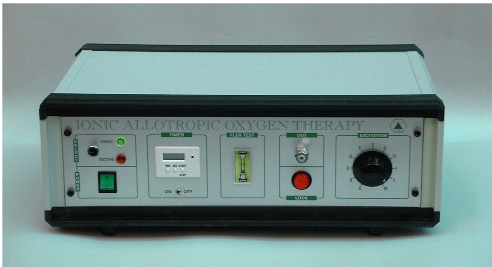
Ionic Allotropic Oxygen Therapy (IAOT)

VIA RONCHI, 30 – 20134 – MILAN (I) - tel. +39 02 21597558 - fax +39 02 21597559 - E. MAIL: zener@zener-seab.it